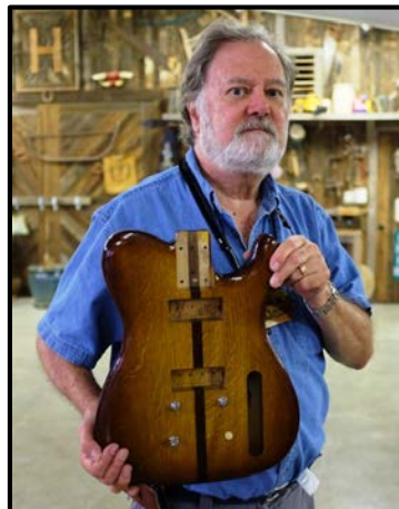
Telecaster guitar body in oak

Isabel Nieves made a lazy susan of walnut and oak.