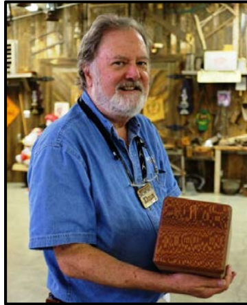
Leopard-wood cremation urn.