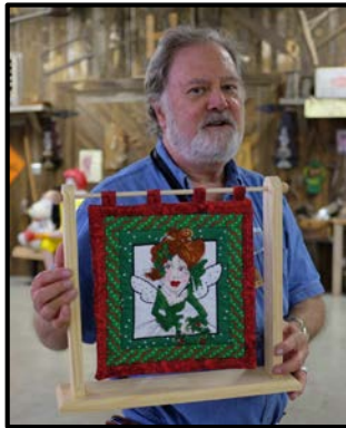
Mini-quilt rack in maple