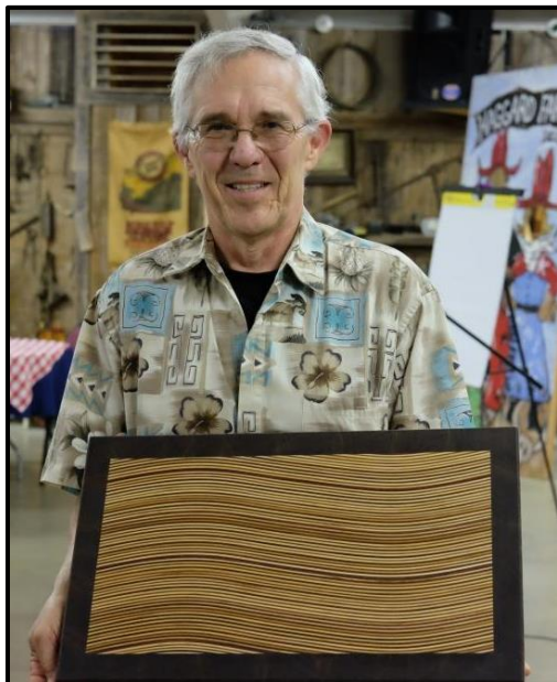
Richard Kenyon made this walnut end grain cutting board with a wave design in walnut, cherry, maple and purple heart.

The winner for the $10 show & tell drawing was Richard Kenyon!