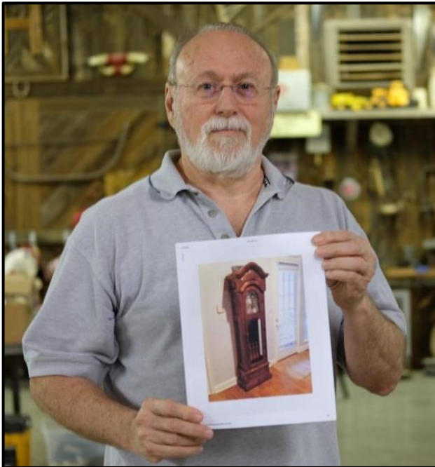
Gary Badger designed this walnut grandfather clock using SketchUp. He finished this masterpiece with hand rubbed Waterlox.