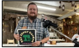
SHOW & TELL PAGE 2