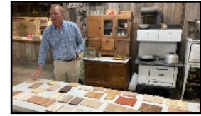
CENTRAL HARDWOODS PROGRAM PAGE 7