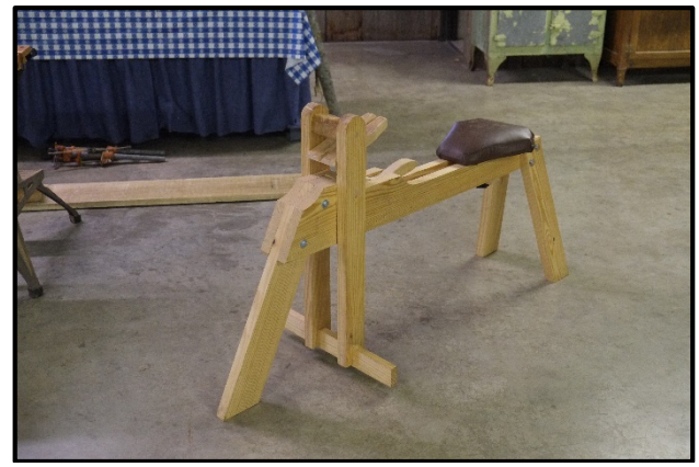
Shave horse used to shape stock for bending