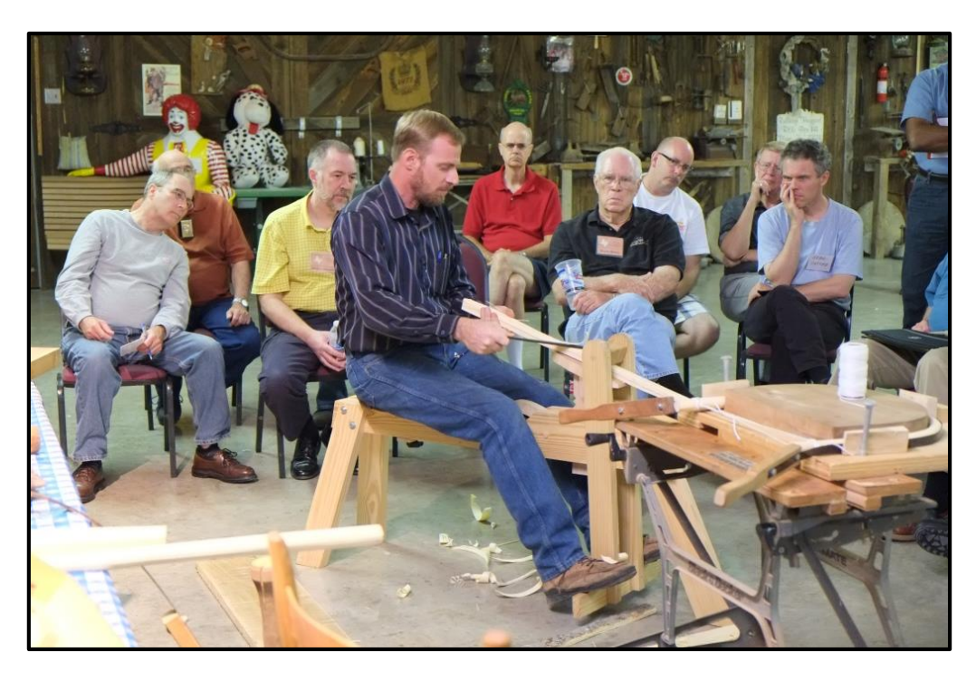
The shaping starts on the shaving horse