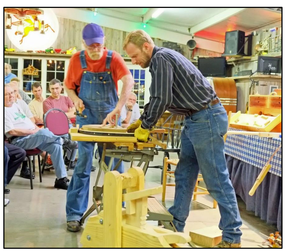
Once the piece is soft enough it is placed into a form to control the shape once it dries.