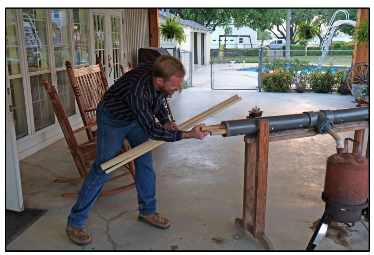
The steam bender is loaded to prepare the pieces for bending