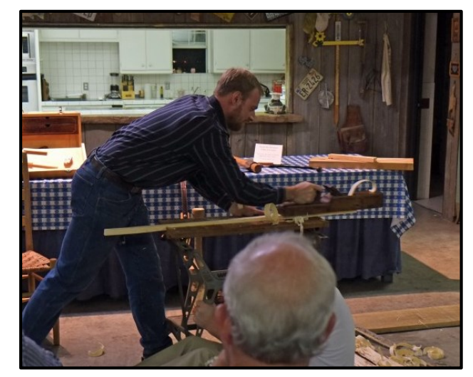
Some of the shaping is done with a plane