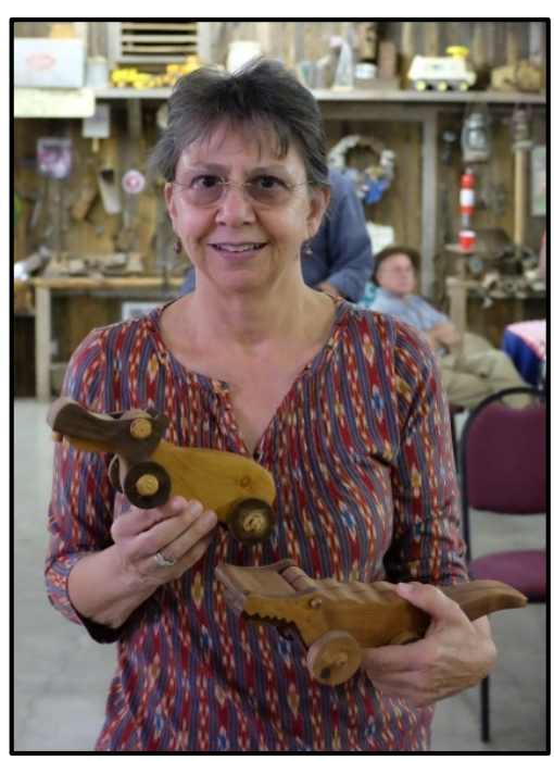
These action toys were made by Isabel Nieves. The mouths of the hippo and alligator open and close as the wheels turn.