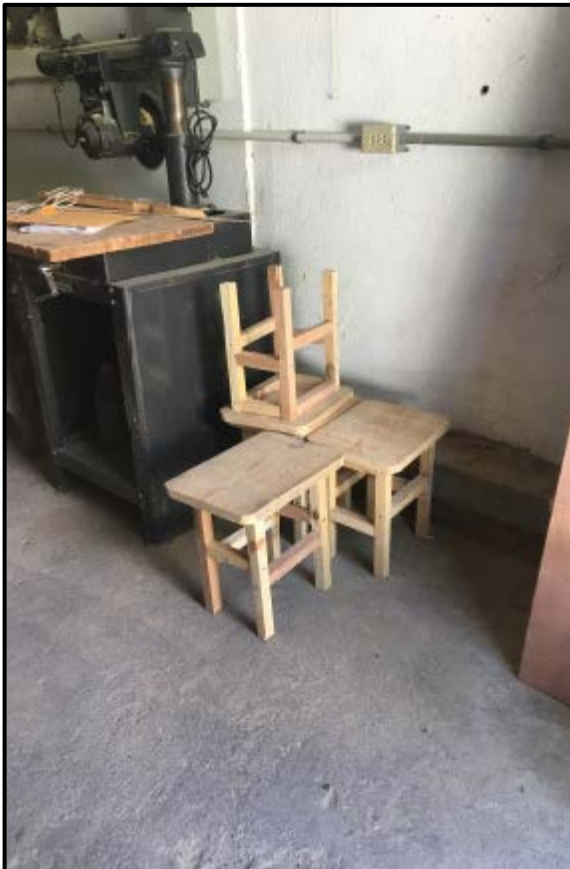
The first project was a stool made from pallets