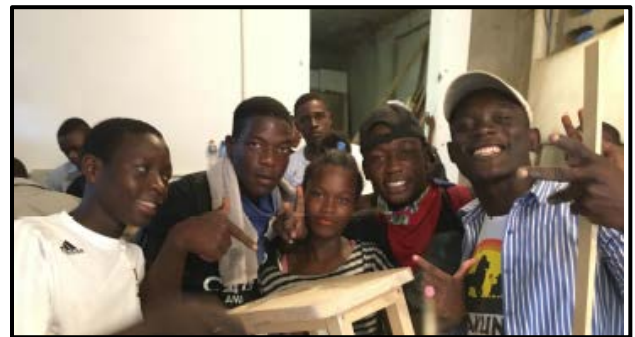
The students were excited and proud of their accomplishments!