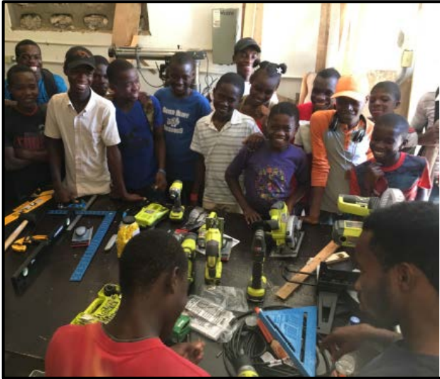
Members of the first woodworking class.