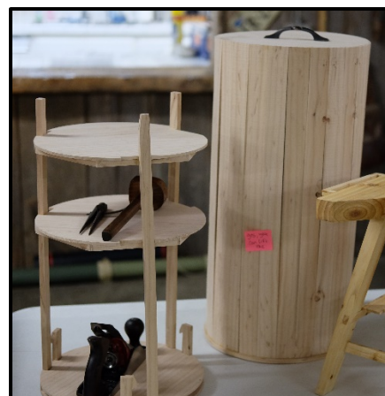
The cylinder drops over the shelves and twists to lock in place to carry the tool box wherever needed.