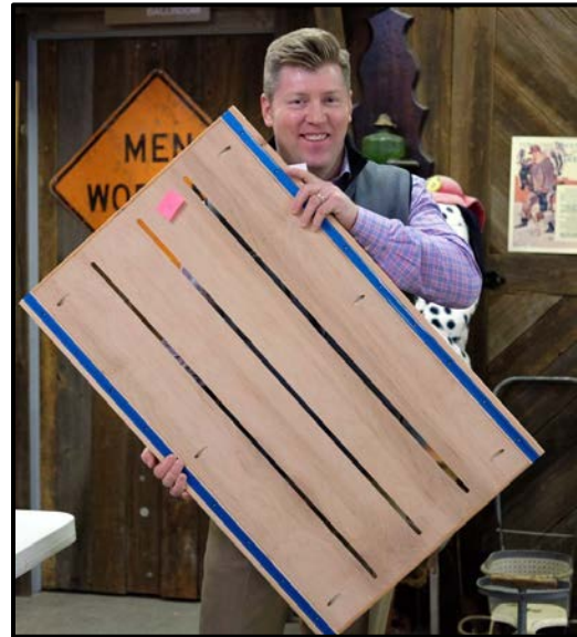
Swede Hanson made this clamp board for gluing up projects. The 2 x 4 frame has T-tracks for clamping along with the clamp slots in the center of the board.