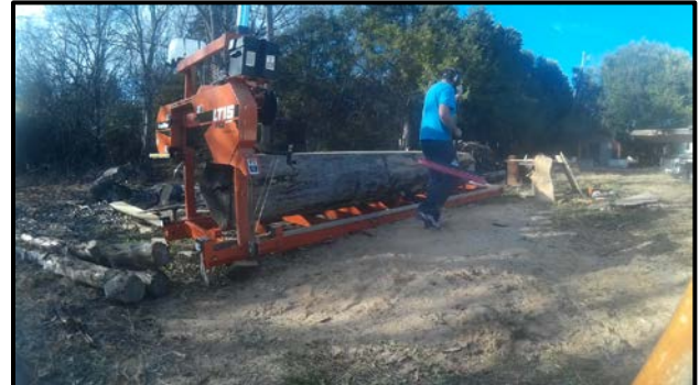
This shows Lloyd hard at work milling a log.