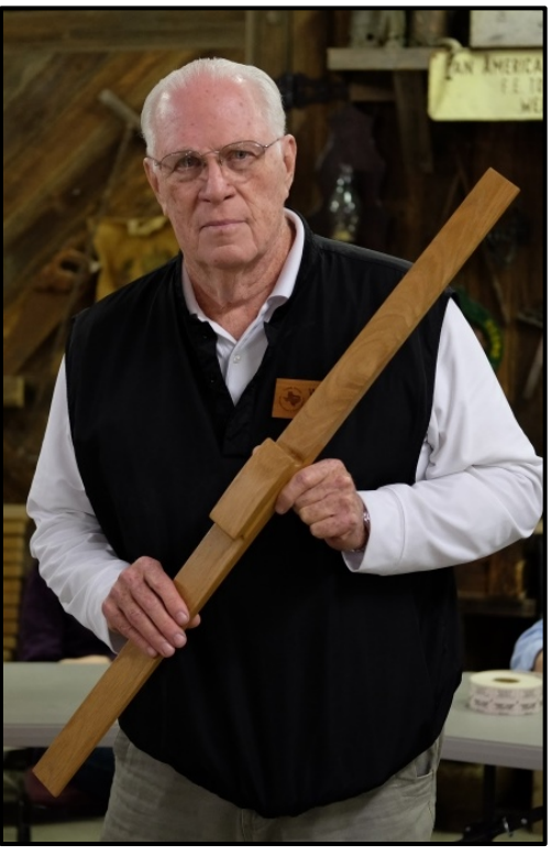
Wayne Bower made this Paul Sellers straight edge out of oak. It was a one-evening project.