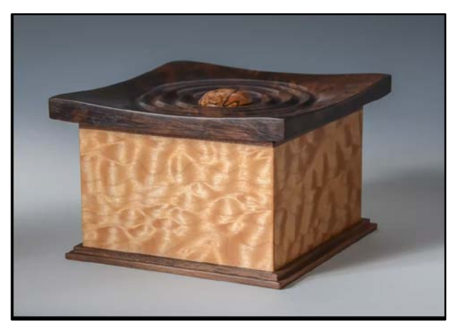
Ron Giordano made this box out of quilted maple and walnut burl for the lid. For the lid, he used a ripple effect