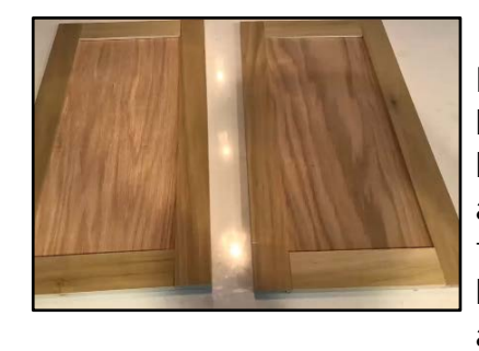
He dry-fitted his doors before gluing and painted the panels before assembly.