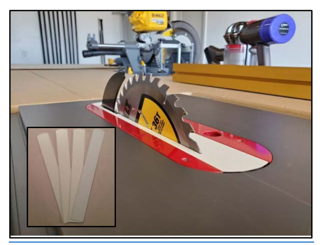
The machined base plate starts about $50 and four MDF inserts are 4 for $12.

Bodie said he found a neat and inexpensive glue mat on the internet hiding under the description of pastry mat. They are about ½ the price of official glue mats and are available in various sizes.