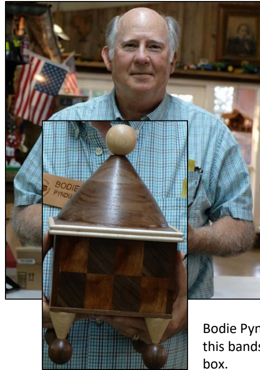
Bodie Pyndus made this bandsaw beater box.