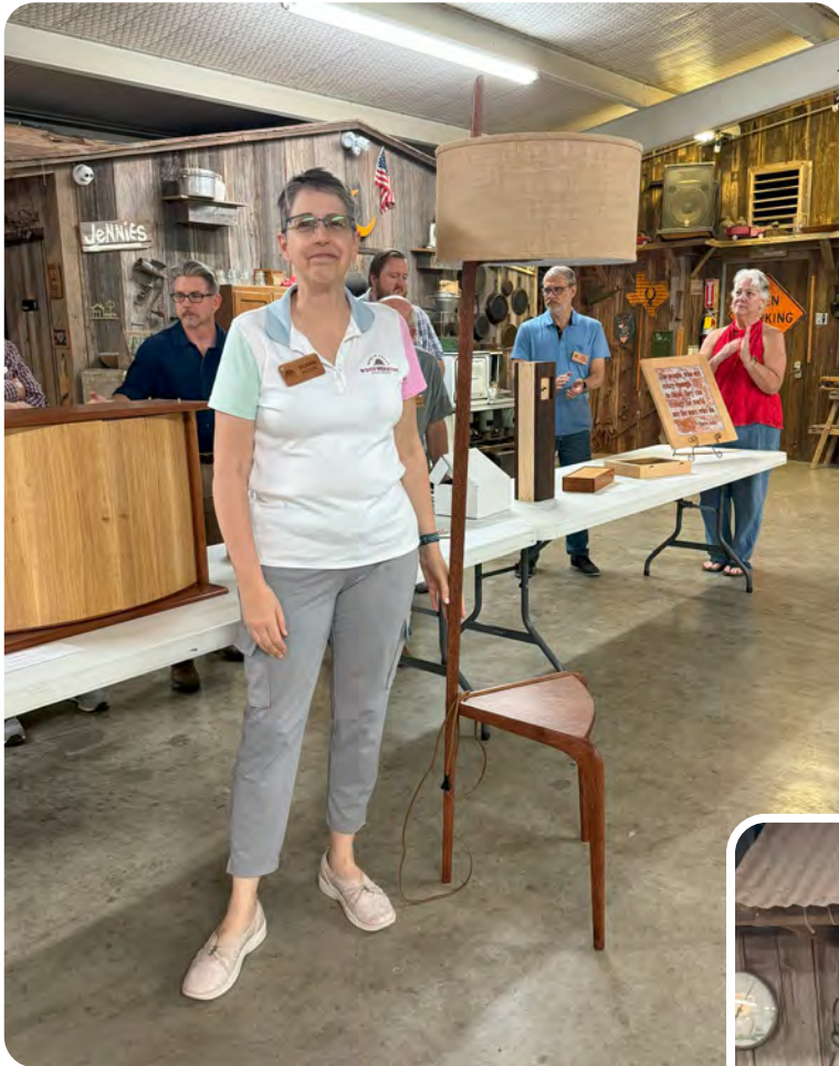
Susan Walters created this beautiful Rispal 167 Replica Floor Lamp out of Mahogany.