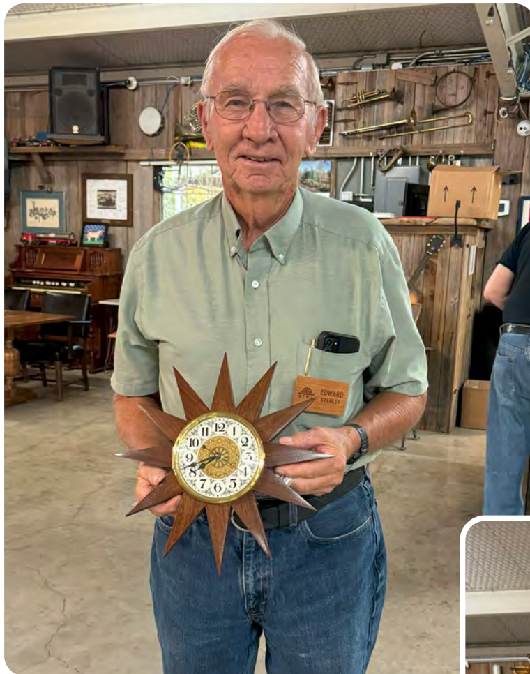
Edward Stanley created this unique Sun Burst Clock out of Walnut.