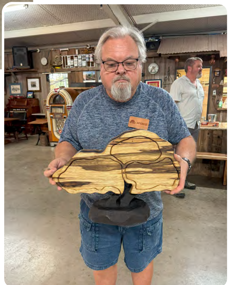
Spence created this Tree Bandsaw Box with Black Limba and Wenge.