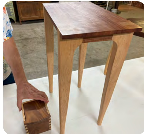
Bodie Pyndus made this Maloof Joint Stool out of Walnut and Maple. He also shared an End Table crafted with Bradford Pear and Maple Legs, along with a Tissue Box made with Walnut and Spalted Pecan.