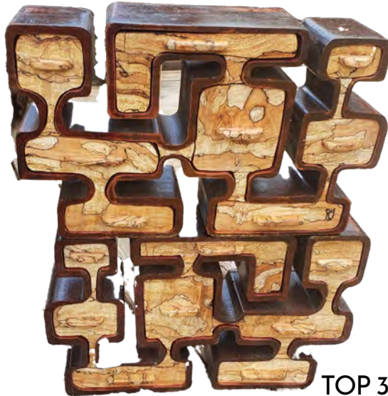
2019 TOP 3 BEST IN SHOW