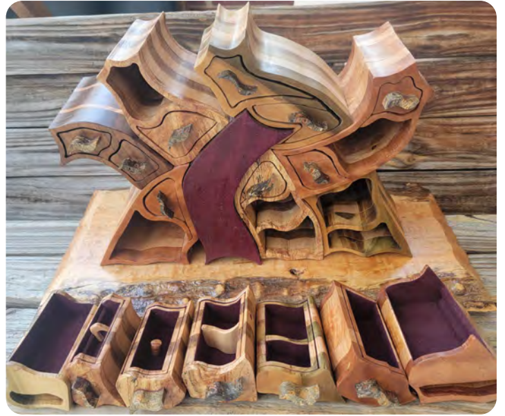
2024 BEST IN SHOW AND 2ND OVERALL