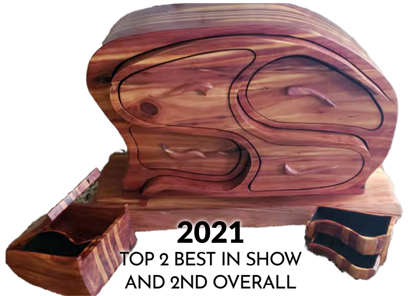
2021 TOP 2 BEST IN SHOW AND 2ND OVERALL