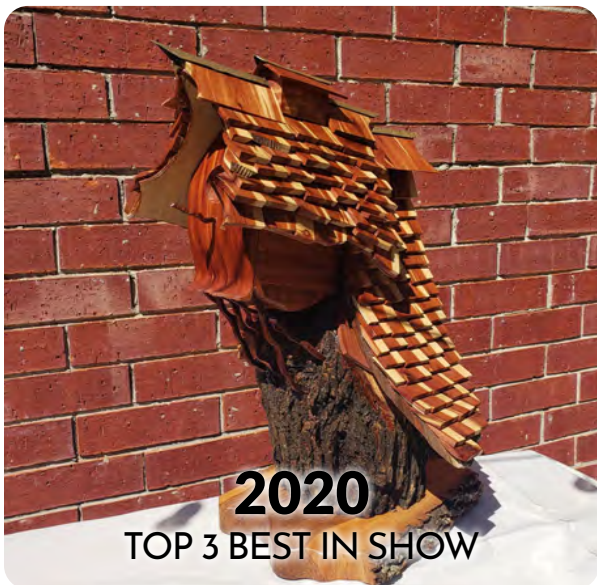
2020 TOP 3 BEST IN SHOW