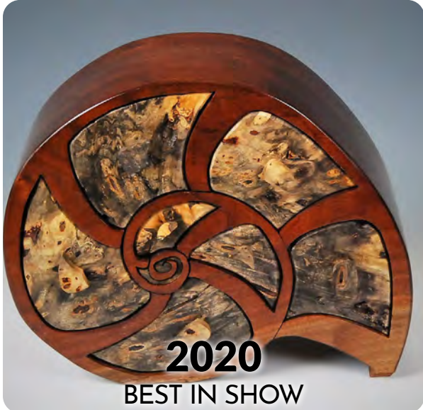
2020 BEST IN SHOW