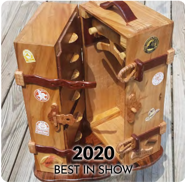
2020 BEST IN SHOW