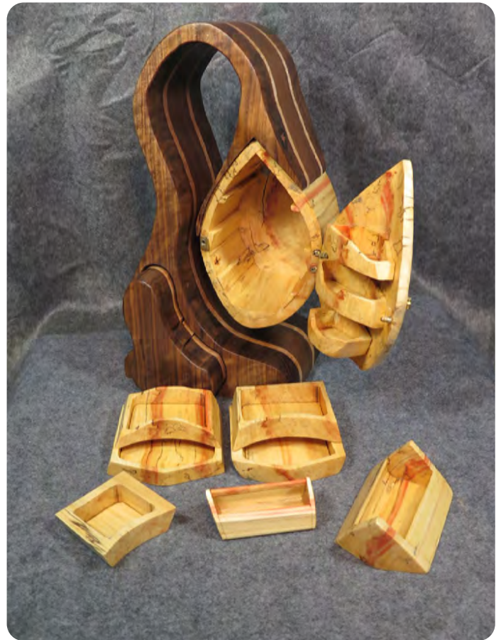
2023 TOP 3 BEST IN SHOW AND 2ND OVERALL