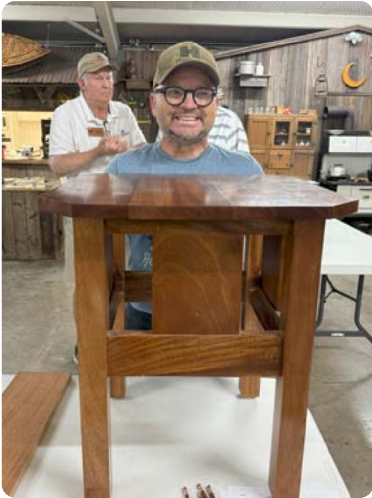
Phil Weber made a Stickley inspired Clipped Corner Table out of Mahogany.