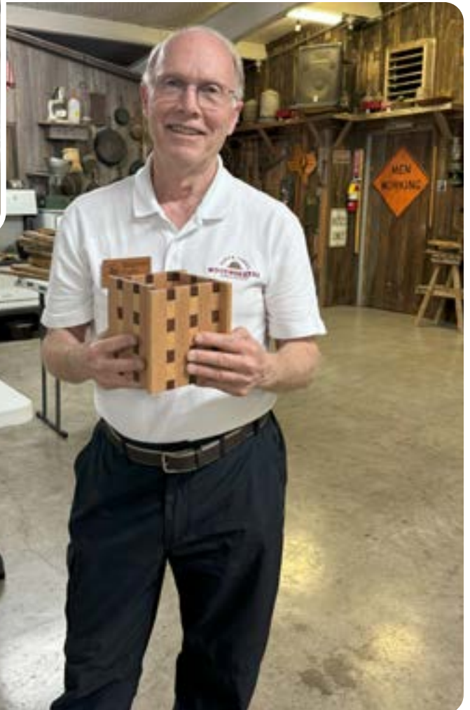
Steve Rogers crafted this Flower Vase out of Oak and Mesquite!