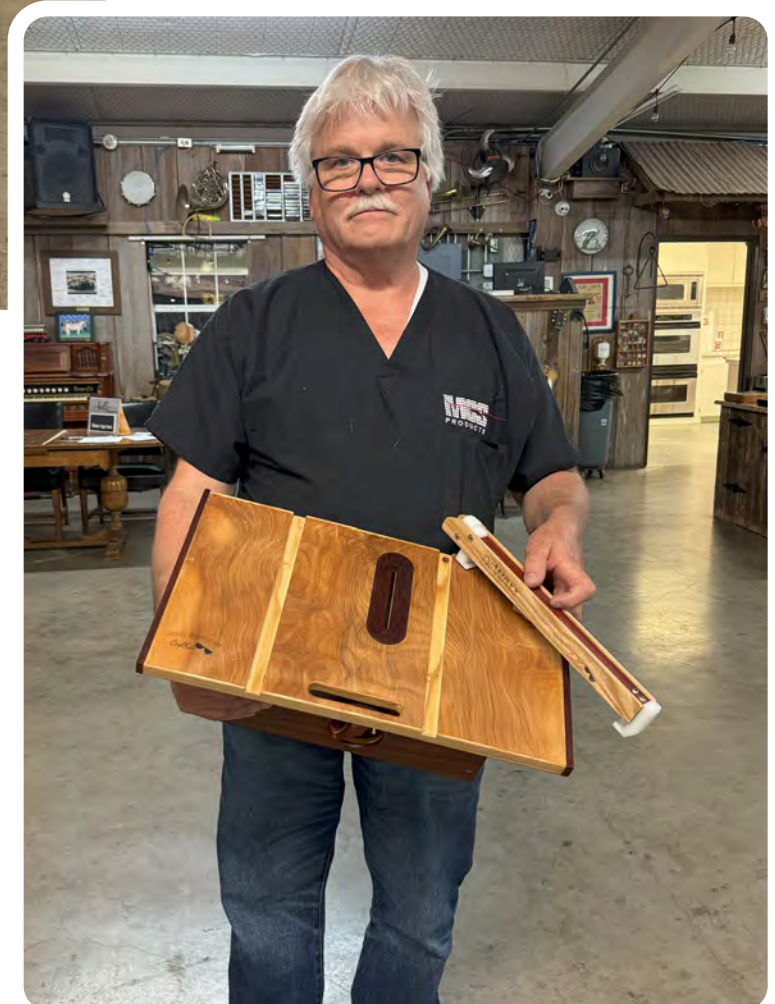
Matthew Smithers created this Table Saw Toy! He used Purple Heart, Ash and Walnut.