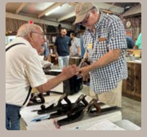
NTWA Newsletter is published monthly for the members of NTWA. Digital archives are available at ntwa.org.

*Don't forget to bring CASH to enter our monthly drawing! Remember, every ticket you buy gets you TWO CHANCES TO WIN, your ticket(s) go into the pot for that month's drawing AND they are saved to go into the pot for the big drawing in July!