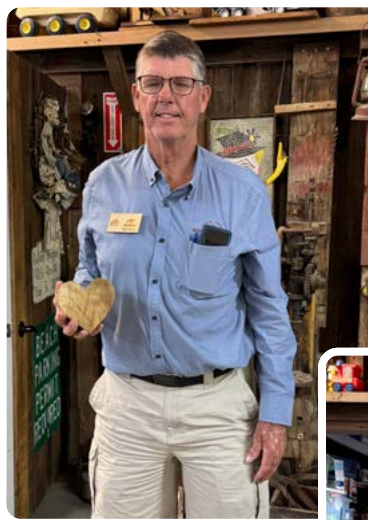
Jay Munson created this Bandsaw Box out of Bur Oak, Walnut and Maple!