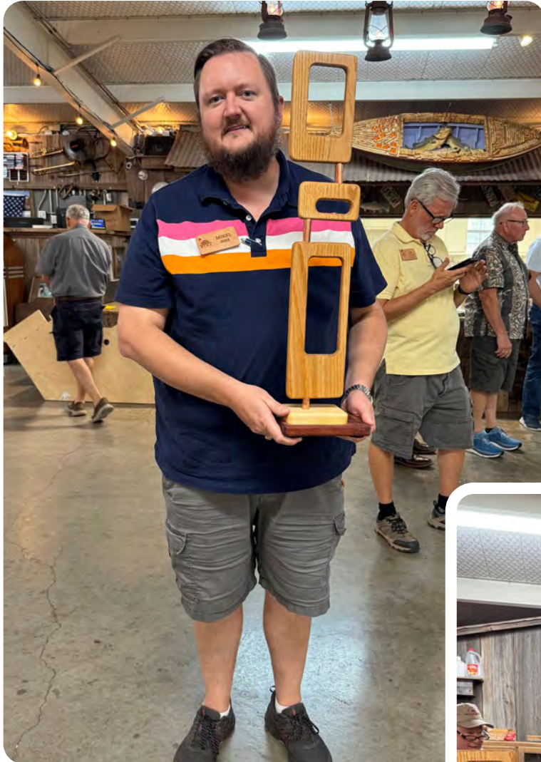
Mikel Duke created this Beautiful Sculpture out of Oak and various other woods!