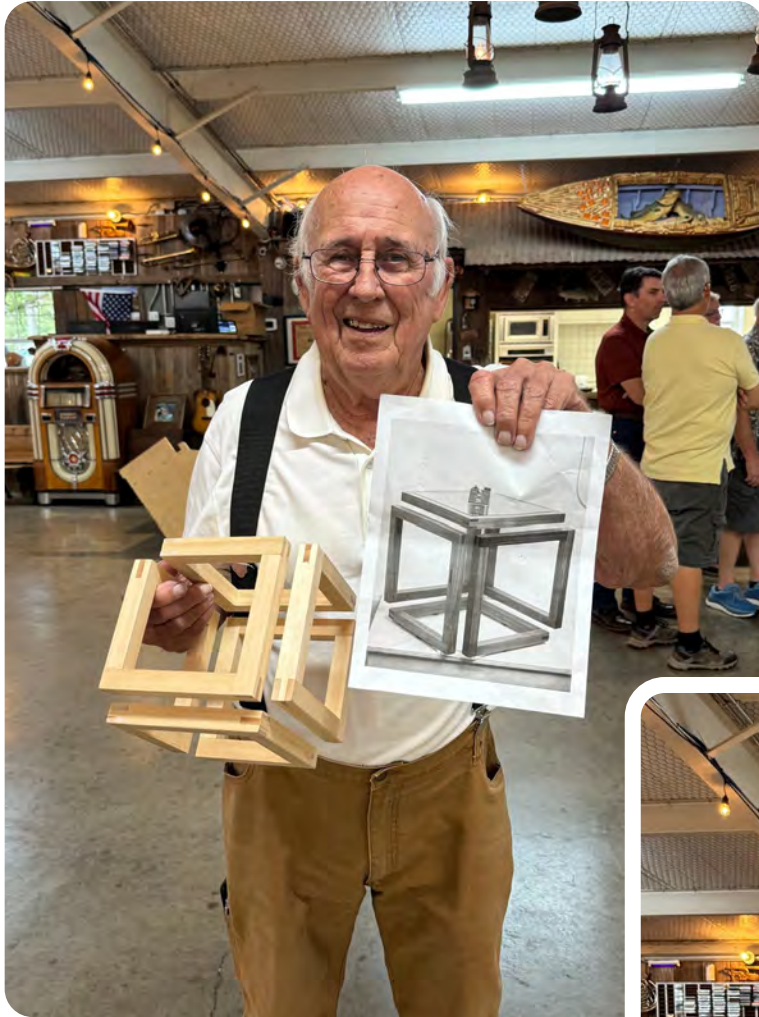
Gary Turman designed this beautiful Infinity Cube out of White Pine!