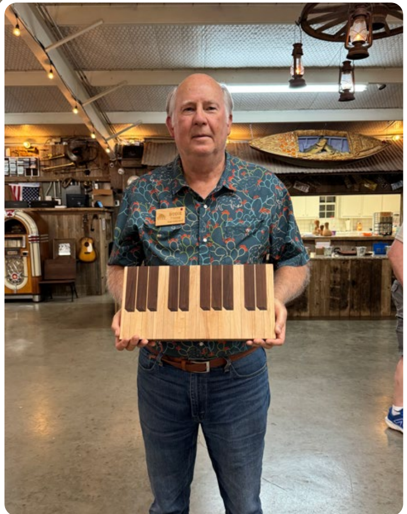
Bodie Pyndus designed his Piano Cutting Board out of Walnut, Maple and Ebony Veneer.