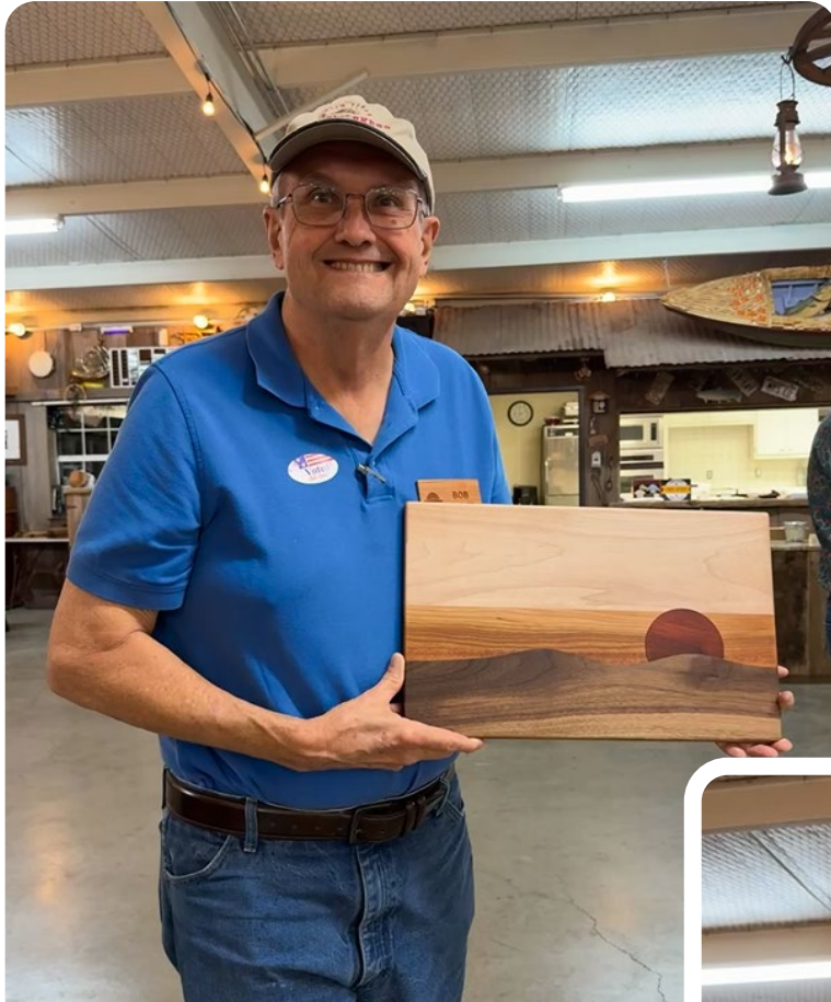
Bob Zeigler crafted this Sunset Cutting Board using Maple, Cherry and Walnut.